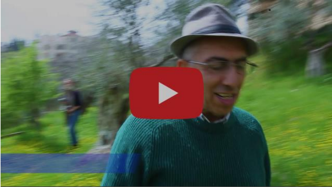
A tour of the Bethlehem Palestine Museum of Natural History