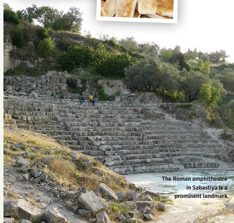
The Roman amphitheatre in Sabastiya is a prominent landmark