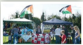
Fundraising by HAFSA at the Hanwell Carnival

When you pay your subscription please email info@hafsa.org.uk to let us know your name and we will make sure you are on our mailing list.