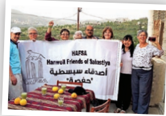
HAFSA people visiting Sabastiya