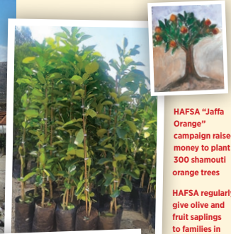
HAFSA "Jaffa Orange" campaign raised money to plant 300 shamouti orange trees