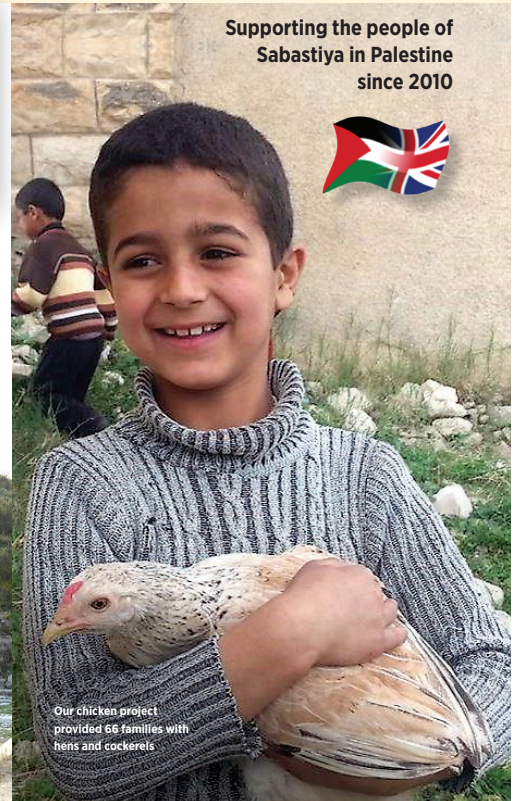
Our chicken project provided 66 families with hens and cockerels

Supporting the people of Sabastiya in Palestine since 2010