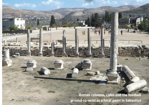
Roman columns, cafés and the football ground co-exist as a focal point in Sabastiya

Sabastiya is an amazing place in a beautiful setting with warm welcoming people.