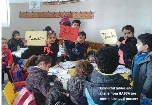
Colourful tables and chairs from HAFSA are now in the local nursery