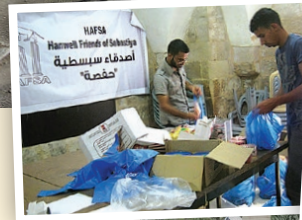
Volunteers packing Ramadan food parcels for families in need