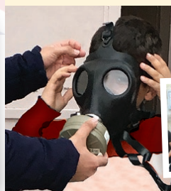
HAFSA funded 80 gas masks for households affected by tear gas fired by the Israeli army and funded first aid training for a new volunteer emergency team

Sabastiya stands on historical and biblical land and can be proud of a number of important archaeological sites. Today you can see the ruins of ancient Sabastiya and feel the power of seven successive cultures dating back 10,000 years: Canaanite, Israelite, Hellenistic, Herodian, Roman, Byzantine and Ottoman. According to religious tradition, the head of John the Baptist is buried there.