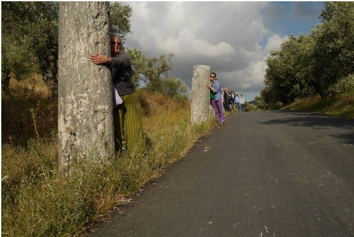
Hugging Sabastiya's Roman columns on one of our visits